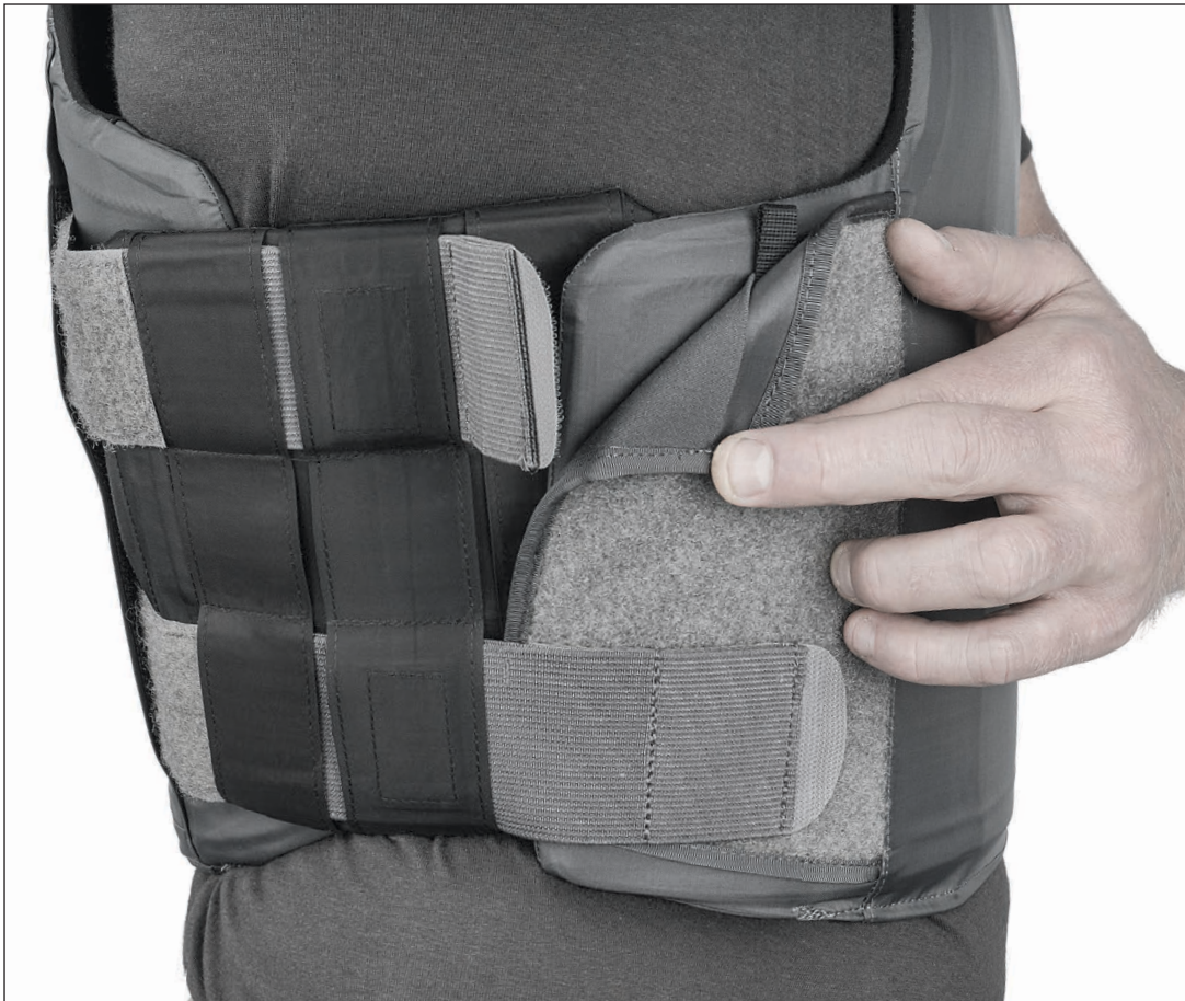
03 OPTIONAL SIDE ARMOR