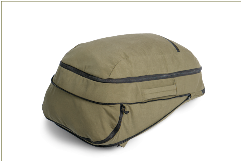
Expanded EXP 1500™ PACK.