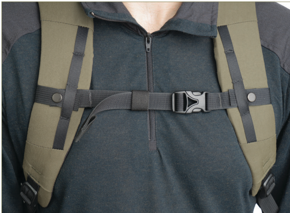
Fully attached and connected sternum strap.